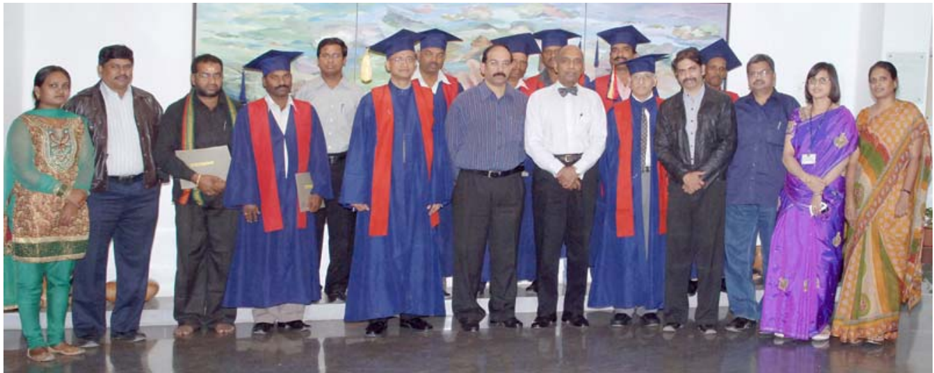
The students with the faculty members (2010 Batch)