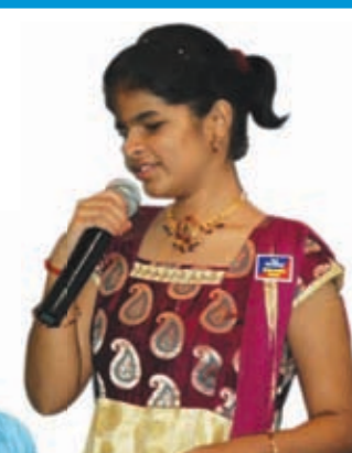
Shrawya 85% (International Board of education, Inclusive school)