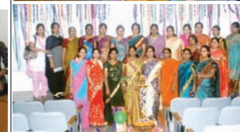
At Hyderabad: Taking the oath & all the senior nurses (below)