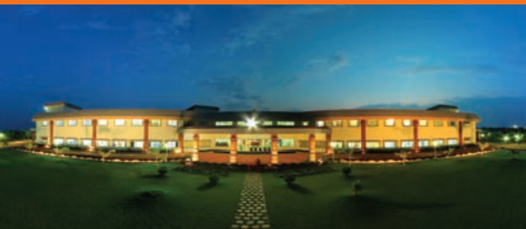
LVPEI tertiary centres at Visakhapatnam (top) and Bhubaneswar (above)