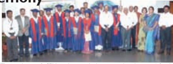
The graduating DCEH students with the external and internal faculty