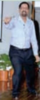
Srikkanth demonstrates a batting action

Kris Srikkant's talk on December 19, part of LVPEI's Silver Jubilee Public Lectures, had as much flair as can be expected from the dashing opening batsman of the 1983 World Cup team and current Chairman of the BCCI Selection Committee. Passion, hard work and innovation are the three mantras for success, he said and passion is the most important for healthcare professionals as they are caregivers to the people.