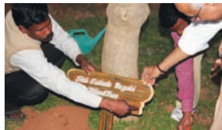
Sri Subroto Bagchi (right) plants a tree at the Bhubaneswar campus

LVPEI Bhubaneswar organized the Second Bijayananda Patnaik Memorial Lecture on January 26, 2012. Shri Subroto Bagchi, Vice-Chairman and Gardener, MindTree delivered the Memorial Lecture and interacted with the staff of the entire LVPEI network by videoconference. A cultural program was also organized on the occasion.