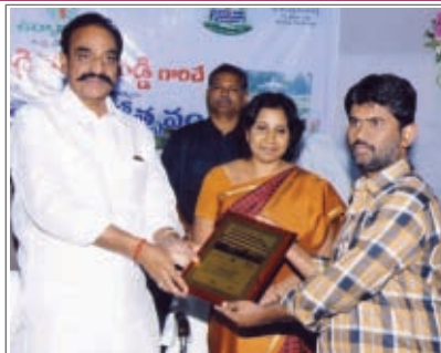
LVPEI won the Second Prize in the Gardens Maintained by Institutions Category. January 2012