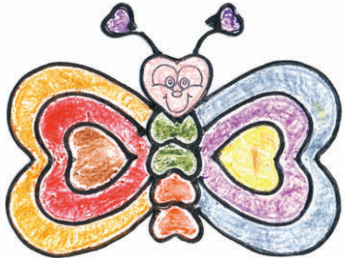
by Sai kiran