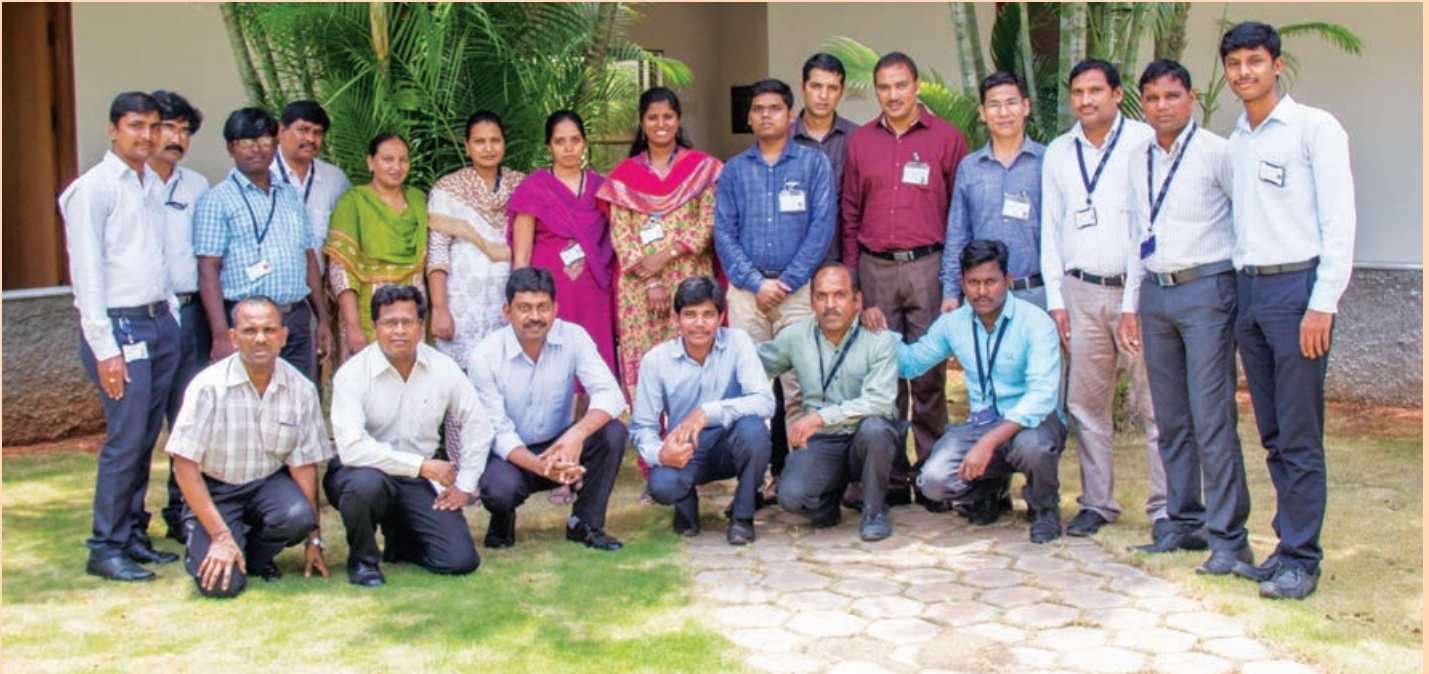
Diploma in Community Eye Health (DCEH), Students, GPR ICARE and OEU team members 2017