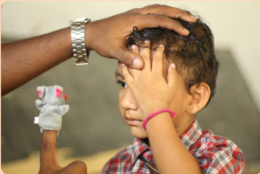
School Screening Program