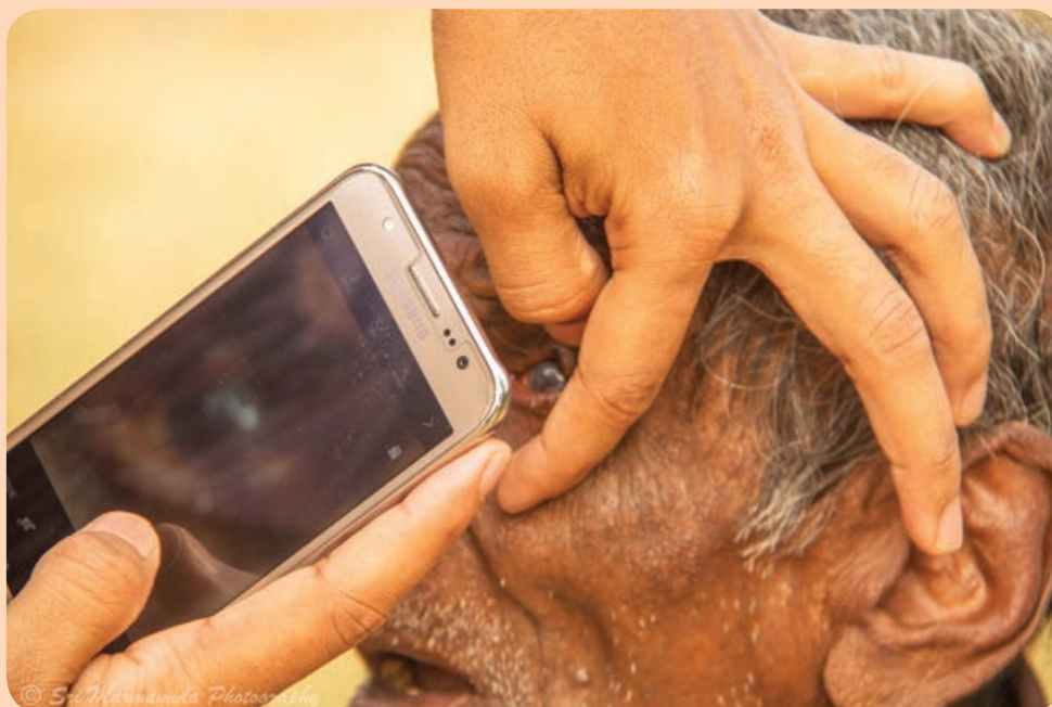
Community Screening Program

Community eye health extends the individual patient-based traditional clinical practice of ophthalmology to the assessment and facilitation of good eye health to the population as a whole.