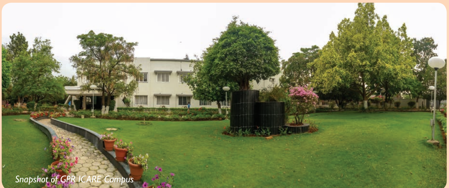
Snapshot of GPR ICARE Campus