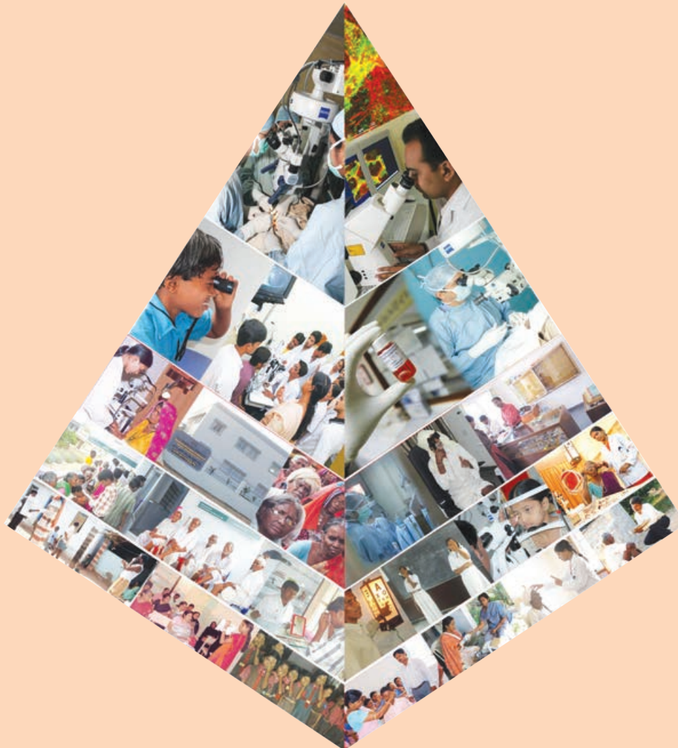
The LVPEI Eye Health Pyramid

The mission of L V Prasad Eye Institute is to be a centre of excellence in eye care services, basic and clinical research into eye diseases and vision-threatening conditions, training, product development, and rehabilitation for those with incurable visual disability, with a focus on extending equitable and efficient eye care to underserved populations in the developing world.