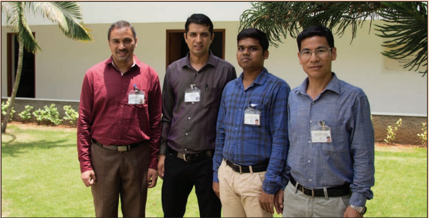
Diploma in Community Eye Health Students - 2017